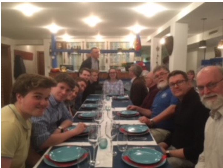
The back row of the Choir before dinner

tradition. All the members of the tour, children and adults gathered together for the last evening's meal in a delightful restaurant in the city centre.