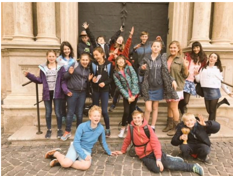
The choristers on tour

We made our way to London Gatwick for our flight to Vienna. On the flight our cover as the Exeter Cathedral Choir 'was blown', and while awaiting take off the Steward asked the Choir to sing! A resounding This joyful Eastertide was sung to the passengers with much appreciative applause. To encourage the passengers in their giving of loose change for the EasyJet charity appeal to eradicate Polio throughout the world, the Choir sang Mozart's Ave Verum ; which we hoped spurred on generous giving!